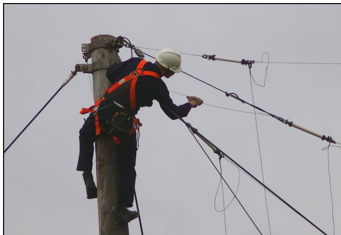
Figure 2: ZL1AZE working on repairs to a set of vee beam antennas

A critical issue is the technical compatibility of amateur radio operations with the RF noise that is generated by the wind farm. Discussions with other amateurs in Europe indicate that radio interference is not normally an issue in or around wind farms, but we will not know for sure until more substantive information is available about the level of noise that is likely to be produced by the specific wind farm technology deployed at Quartz Hill. We need certainty about this issue before making any commitment to building new infrastructure.