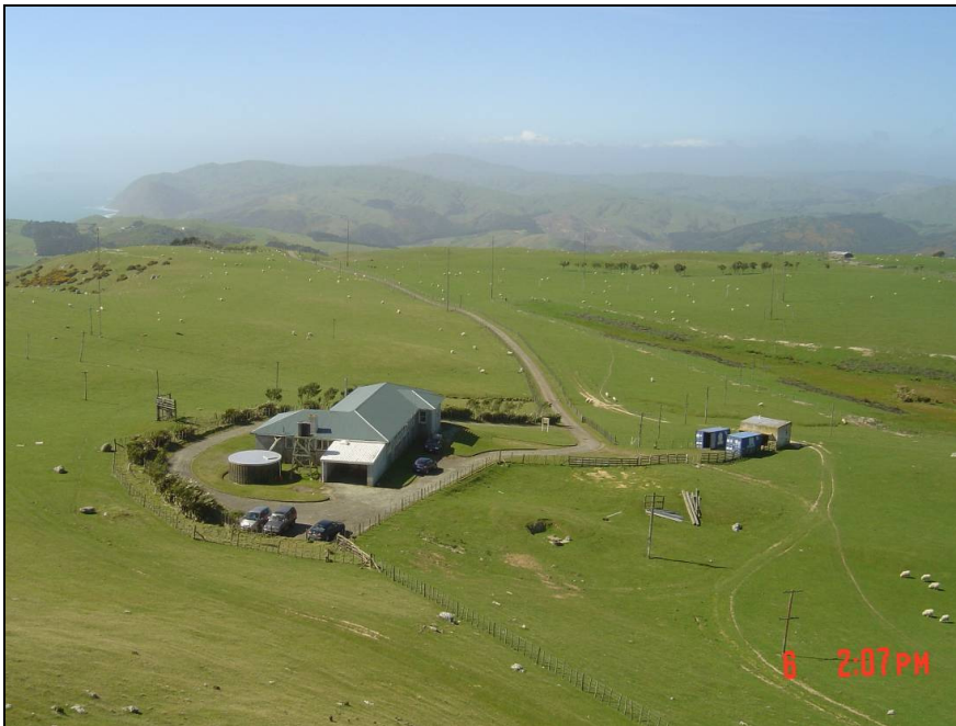
Figure 1: View of the ZL6QH station on a fine day – looking northeast

The Wellington Amateur Radio Club (WARC) first gained access to the large, ex-broadcasting receiving station site at Quartz Hill, Makara, in January 1997. Since then, a small dedicated group composed of club members and other interested amateurs, have laboured to build a large array of antennas for use on all amateur bands between 135 kHz and 30 MHz [refer to Figure 4]. Over this time the station has built up a reputation as one of the leading amateur radio facilities in the Southern Hemisphere. The project has been a source of challenge and enjoyment for everyone involved - whether they have an interest in contest operating, working DX, experimenting with antennas, building and maintaining the station infrastructure, or just being outside in the rugged Quartz Hill coastal environment.